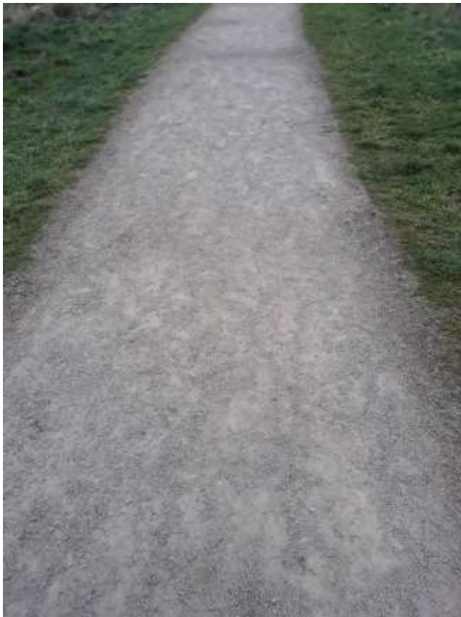
Hard surfaced path

A hard surfaced path has been created with direct access from Heartwood Forest car park. The path has a firm/compacted surface as can be seen below. The route meets DDA standards as seen below, with a consistent width of at least 1.5 m and a gradient no greater than 1:12. The slopes are however at lengths of up to 500m.